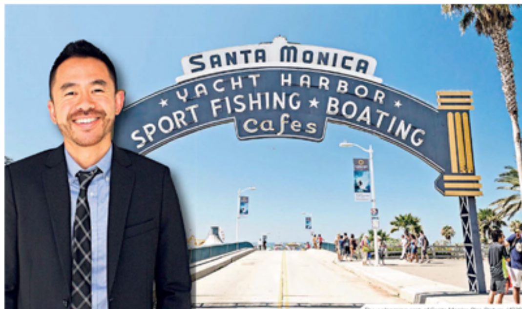
The entrance to Santa Monica Pier, known as the Pier 1000