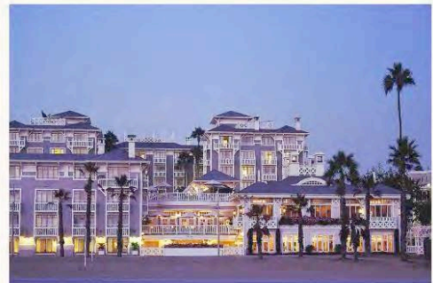
Shutters on the beach

It's hard to do anything other than take it easy here, thanks to in-room relaxation libraries and whirlpool tubs, mesmerising views over the ocean and a fantastic spa with soothing signature treatments. Beyond the hotel, embrace the archetypal SoCal lifestyle by exploring Venice Beach on a retro Kate Spade-designed bicycle or grab a ride in the Shutters' electric car - a Tesla S P85 (the first to be offered by an LA hotel) - and check out the shops, cafés and other highlights of the surrounding neighbourhoods.