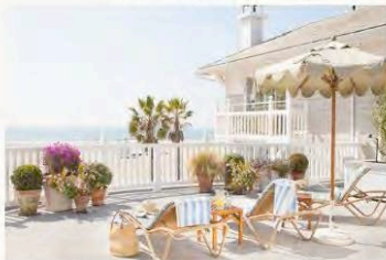
Shutters on the beach