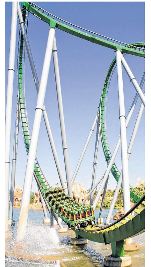
■ Clockwise from main: View over Pacific Park, on Santa Monica Pier in California; rollercoaster at Universal Studios, California; motorbikes heading west on Route 66.