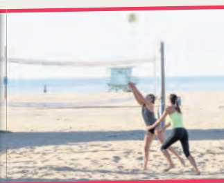
FUN IN THE SUN: Santa Monica's beaches are a hive of activity, with surfing and volleyball being the popular choices

Beach Butler service where you will get served food and drink as you enjoy the sun on your deckchair.