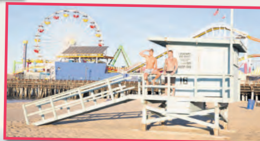
BEAUTIFUL: (clockwise from top) Santa Monica pier, The Marvin Braude bicycle trail, Tongva Park and Santa Monica beach