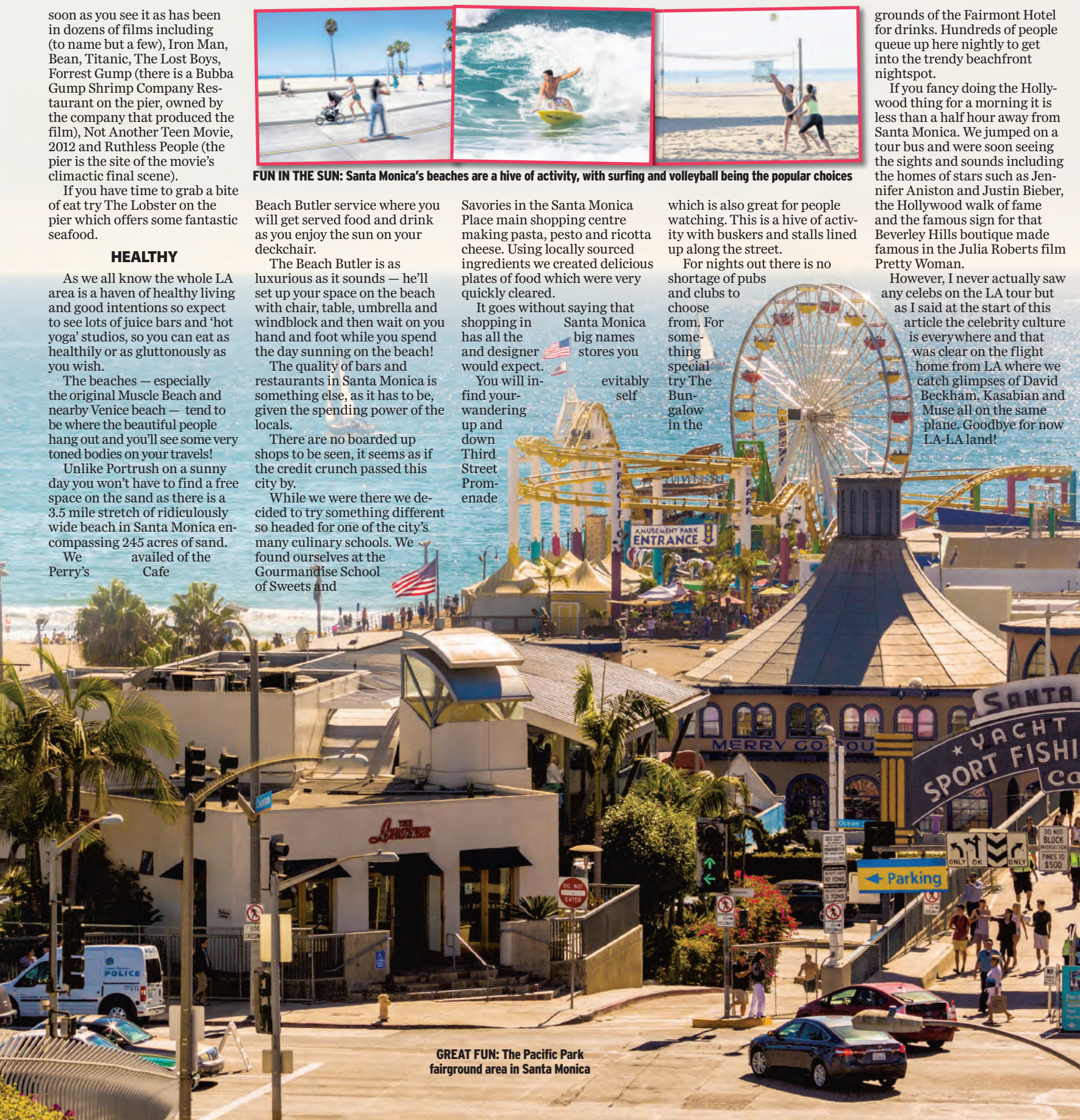
GREAT FUN: The Pacific Park fairground area in Santa Monica

★ Gourmandise School of Sweets and Savories: www.thegourmandiseschool.com ★ Perry's Cafe Beach Butler Service: www.perryscafe.com For full information on what to see and do check out www.santamonica.com