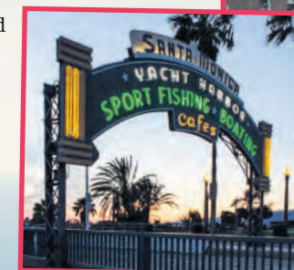
LANDMARK: Entrance to the harbour

If you heed my advice and head to Santa Monica the one thing you MUST do is hire a bike and cycle along the beachfront, passing the power joggers or the athletic and suntanned volleyball players as well as the lifeguards in their Baywatch