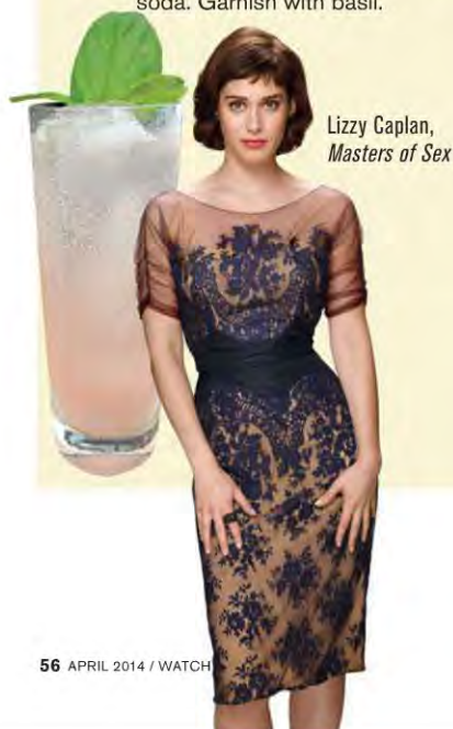
Lizzy Caplan, Masters of Sex

Shake first four ingredients, and strain over fresh ice into Collins glass. Add soda. Garnish with basil.