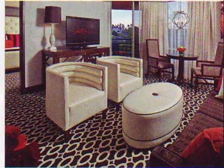
Retro Revival: The Riviera Resort & Spa in Palm Springs has a groovy new look that preserves its vintage flair.

In East San Diego County, the newest option is the upscale Borrego Ranch Resort & Spa in Borrego Springs, complete with an array of outdoor adventure pursuits.